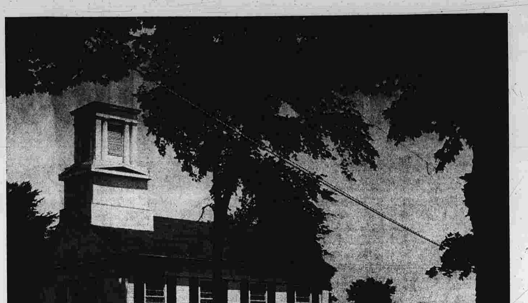
Abim of Churches by Joseph Galarza

MEMBER OF PRESS The Associated Press is exclusively entitled to the use of reproduction of all news dispatches credited to it or not credited to it in this paper and allowing in its publication all rights of reproduction of special dispatches herein are reserved.